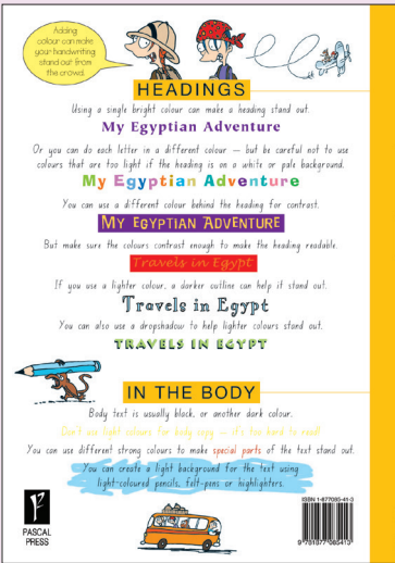
Back cover: Year 6 Student Book